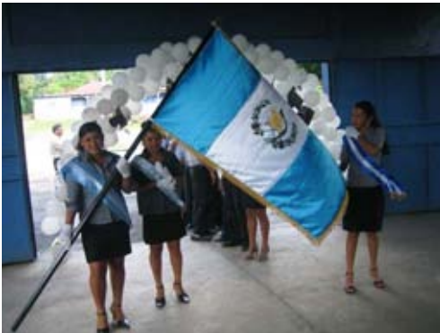
Seeing the students graduate,